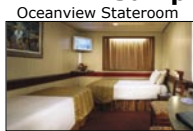
(Category 6A - 6D)