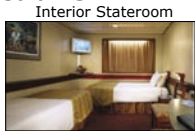
(Category 4A - 4D)

Note: Cabins in categories 4A-6D have two twin beds that can be combined to form a king-size bed. Some cabins can accommodate third & fourth passengers.